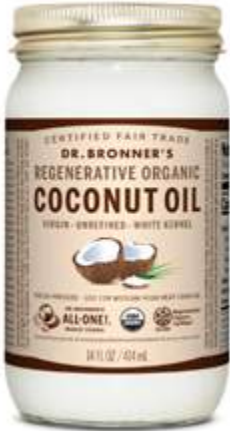
Dr. Bronner's Coconut Oil