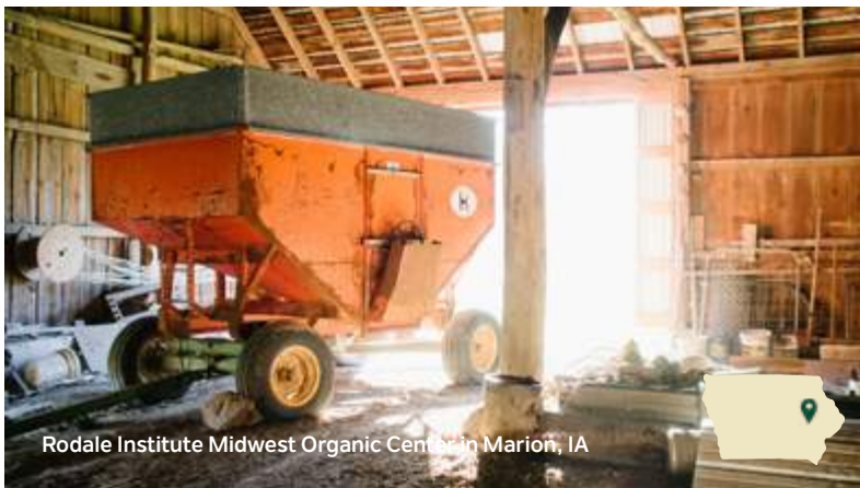
Rodale Institute Midwest Organic Center in Marion, IA

In addition to our headquarters and campuses in Pennsylvania, Rodale Institute operates three research and education hubs, called Regional Resource Centers, throughout the United States. Established to ensure that farmers can access relevant and regionalized research and education opportunities, the Regional Resource Centers provide tailored science and programming to farmers in our nation's agricultural hotspots.