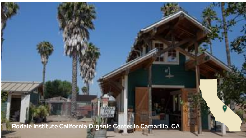
Rodale Institute California Organic Center in Camarillo, CA

According to the USDA, the Southern states saw the highest growth in organic farming in the U.S. from 2011-2016, making Georgia a hotspot for organic expansion. From our site at Many Fold Farm, Rodale Institute is studying the effects of cover crops on soil nutrients and focusing on organic vegetable production in Southern soils and climates.