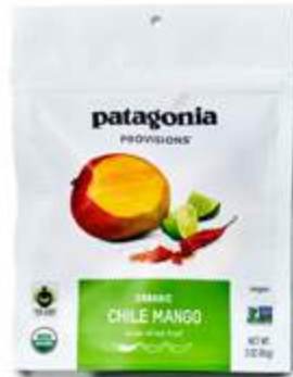
Patagonia Provisions Chile Mango