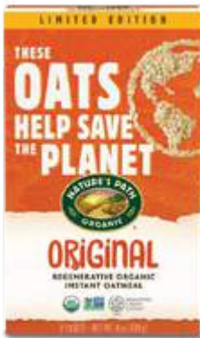
Nature's Path Regenerative Organic Oatmeal