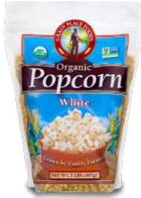
Grain Place Foods Popcorn